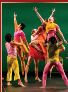
MARK MORRIS DANCE GROUP