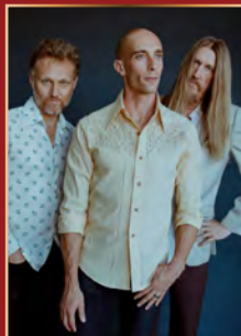
THE WOOD BROTHERS