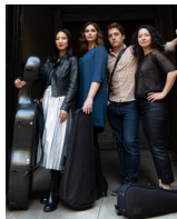
Aeolus Quartet Strings