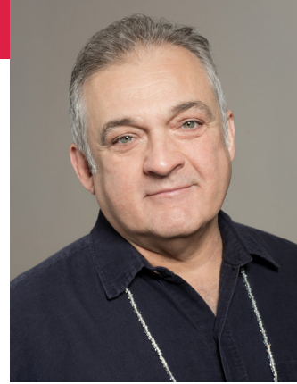
Artistic Director Mark Morris